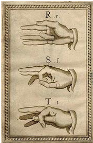
Manual alphabet (Bonet, 1620)